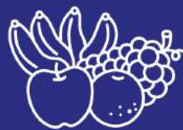
FRUIT, PEEL & FRUIT STONES